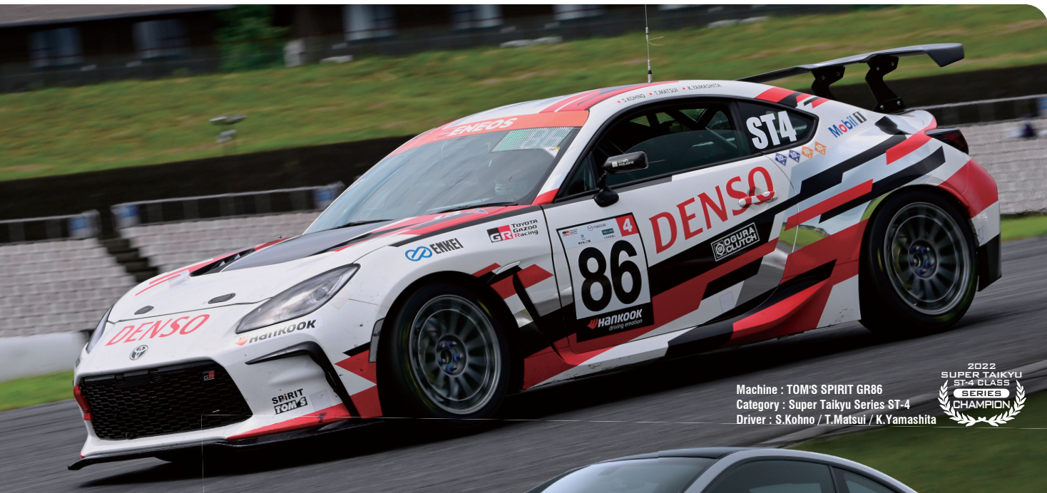
Machine : TOM'S SPIRIT GR86 Category : Super Taikyu Series ST-4 Driver : S.Kohno / T.Matsui / K.Yamashita