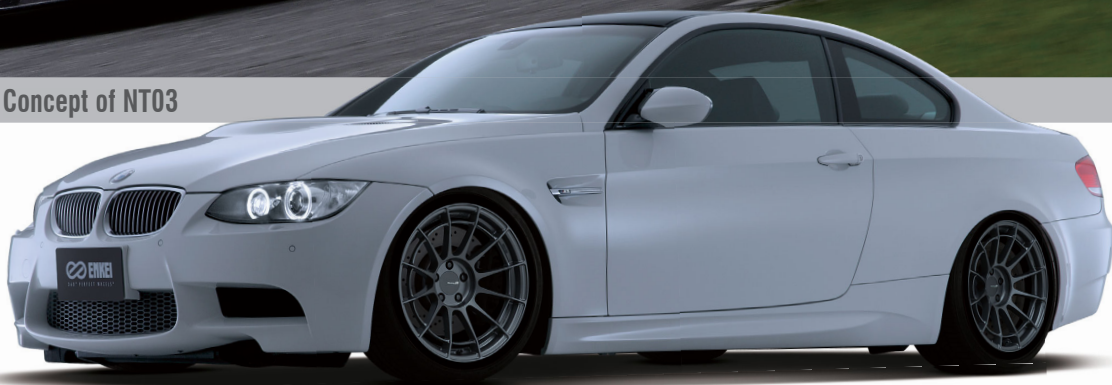
BMW M3 (WD40)

NT03RR The Racing Revolution Concept of NT03