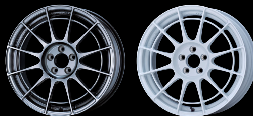
Hyper Silver : 17inch