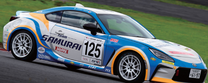
Machine : TEAM SAMURAI GR86 Category : GR86/BRZ Cup CLUBMAN Series Driver : Kouta Matsui